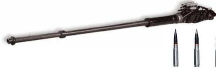
ZTM-1 Automatic Cannon