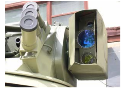
External Optical Block