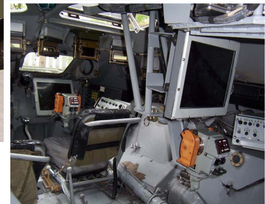
"Track" System Control Terminals