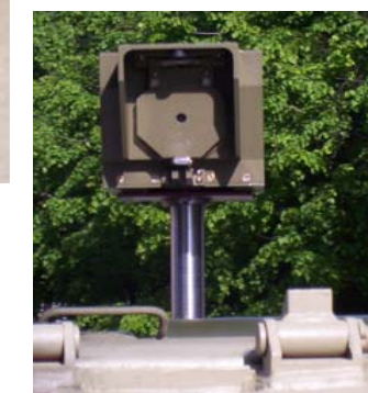
Video camera of panoramic observation system