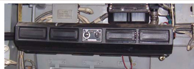
Air Conditioning Plant